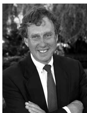
Mayor Christopher Causton District of Oak Bay