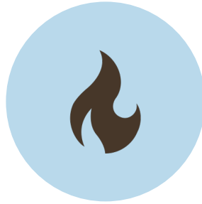
Geography (landslides, wildfire, flooding)