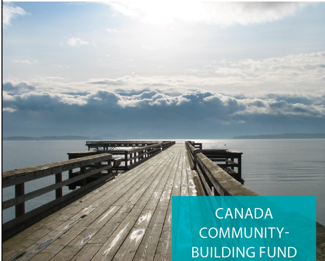
Community pier – Town of Sidney

Canada Community- Building Fund BC | UBCM