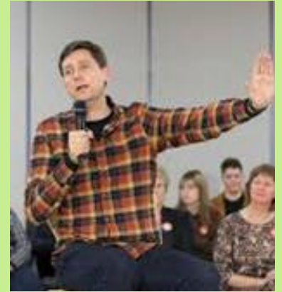
COMMITMENTS TO A CATH LAB AND HOSPITAL TOWER FROM DAVID EBY (NDP) AND JOHN RUSTAD (BCCP)