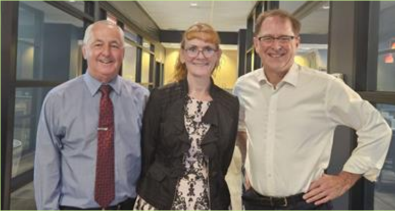
MEETING WITH HEALTH MINISTER HON. ADRIAN DIX